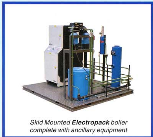
Skid Mounted Electropack boiler complete with ancillary equipment

*Manufactured in accordance with: Module G of the Pressure Equipment Directive - 97/23/EEC. The Machinery Directive: 98/37/EEC. The EMC Directive - 92/31/EEC. The Low Voltage Directive - 73/23/EEC.